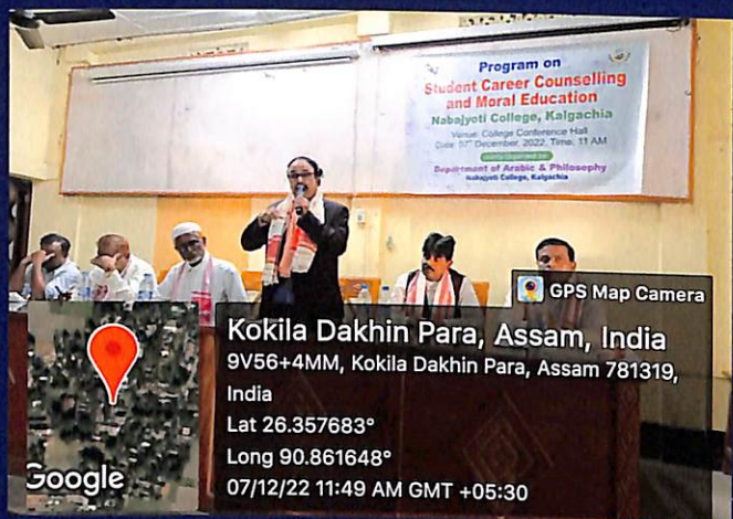
Programme On "Student Career Counselling and Moral Education" organised by- Department of Arabic & Philosophy, Nabajyoti College, Kalgachia on 7th December, 2022