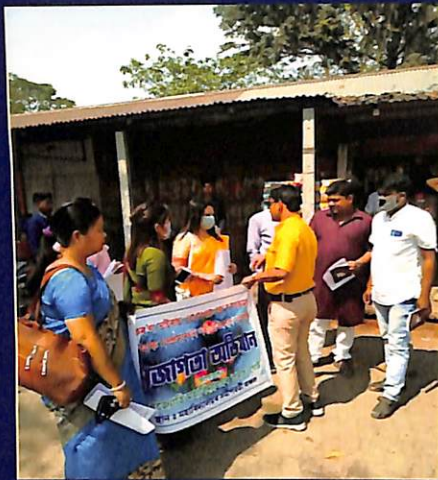
Awareness Programme on Covid-19 Organised by- Prayash, Nabajyoti College, Kalgachia among the Local People of Kalgachia on 19th March, 2020