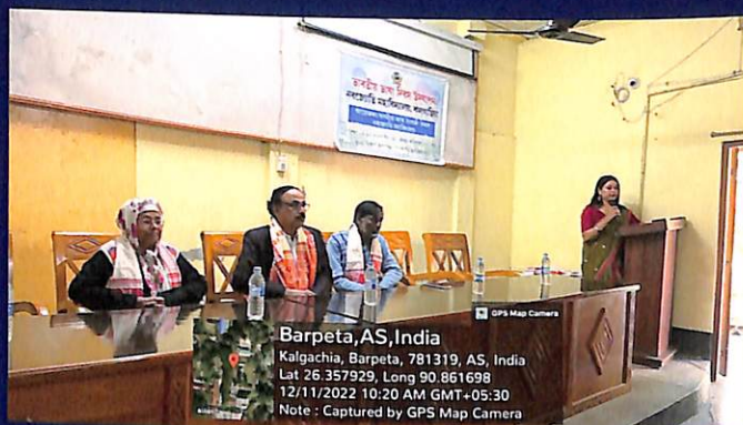
Observation of "Bharatiya Vasha Divas" on 11th December, 2022