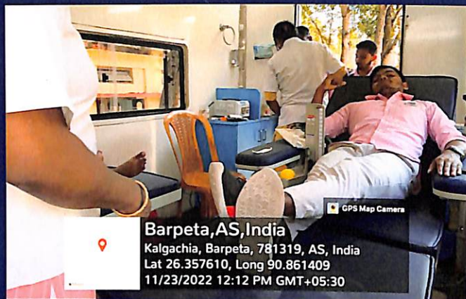
"Blood Donation Camp" Organised at Nabajyoti College, Kalgachia on 23rd November, 2022.