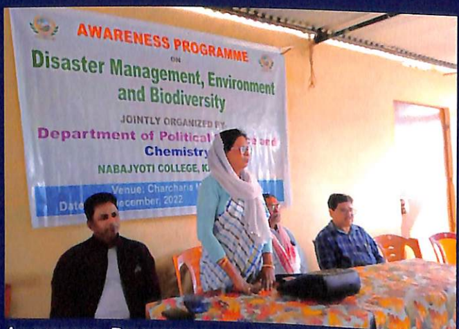
Awareness Programme on "Disaster Management, Environment and Biodiversity" organized by Department of Chemistry and Political Science, Nabajyoti College, Kalgachia on 13th December, 2022.