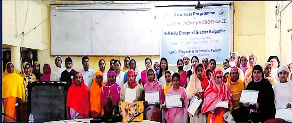
Awareness Programme on "Village Economy & Micro Finance for Self-Help Groups" of Greater Kalgachia organised by- IQAC, Prayash & Women's Forum of Nabajyoti College, Kalgachia on 10th April, 2021.