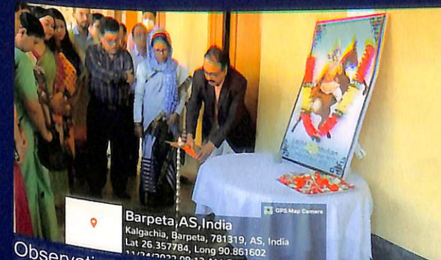
Observation of "Lachit Divas" on 24th November, 2022