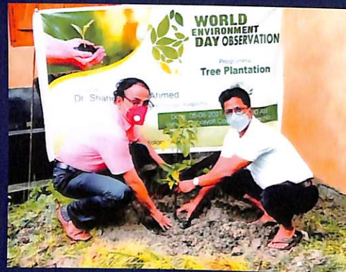
Plantation Programme on the occasion of "World Environment Day" on 5th June, 2021