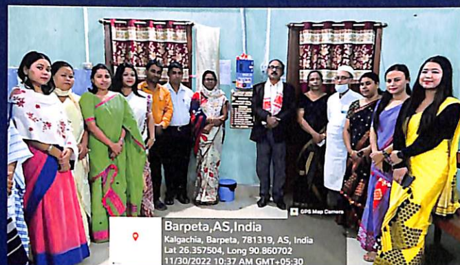
Inauguration of Sanitary Pad Disposal Machine donated by Prayash, Nabajyoti College on 30th November, 2022.