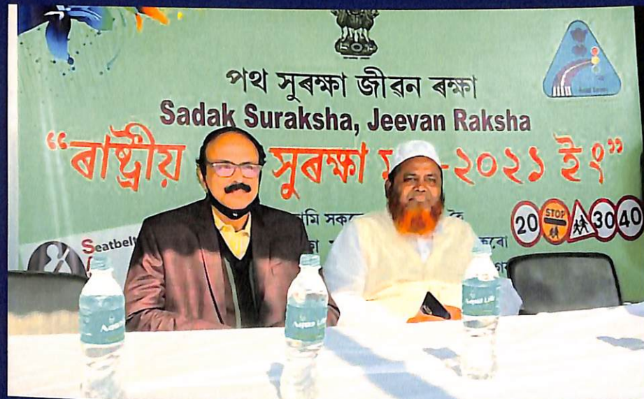
Observation of "Rashtriya Sadak Suraksha, Jeevan Raksha Month-2021" at Nabajyoti College, Kalgachia