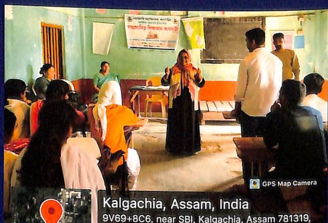
Extention of Education by the Department of Assamese, Nabajyoti College, Kalgachia on 13th December, 2022.