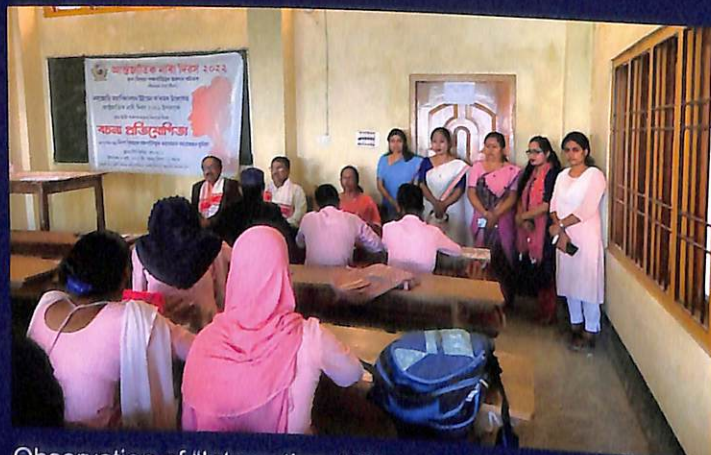
Observation of "International Women's Day" on 8th March, 2022