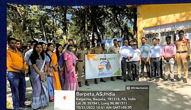
Observation of "National Unity Day" on 31st October, 2022