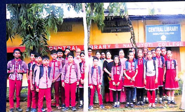
School Children's visit to the Central Library of Nabajyoti College, Kalgachia.