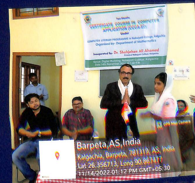
Inauguration of "Two Months Certificate Course In Computer Application (CCCA-22)" Organised by Department of Mathematics, Nabajyoti College, Kalgachia on 14th November, 2022