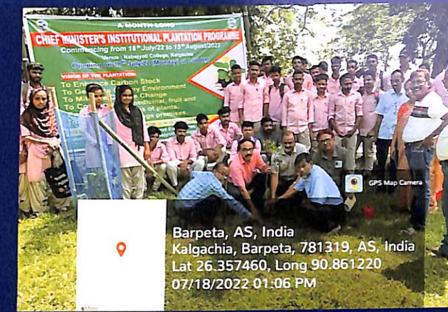
Inauguration of Plantation Programme as the part of "A Month Long Chief Minister's Institutional Plantation Programme" on 18th July, 2022.