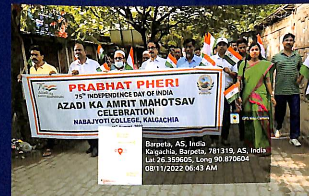
"Prabhat Pheri" rally on the occasion of "Azadi Ka Amrit Mahotsav Celebration" as the part of 75th Independence Day of India organised by- Nabajyoti College, Kalgachia on 11th August, 2022