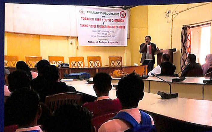
Awareness Programme on "Tobacco Free Youth Campaign & Taking Pledge to Make Drug Free Campus" organized by- Nabajyoti College, Kalgachia on 9th February, 2022