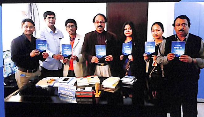
Book released by Hon'ble Principal on 20 th January, 2017