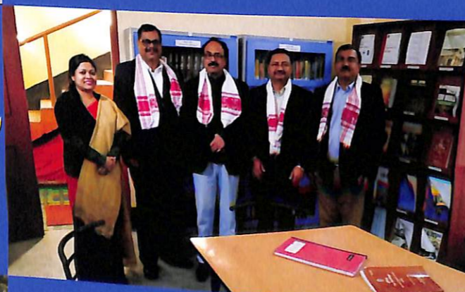
Observation of National Unity Day on 31 st October, 2016