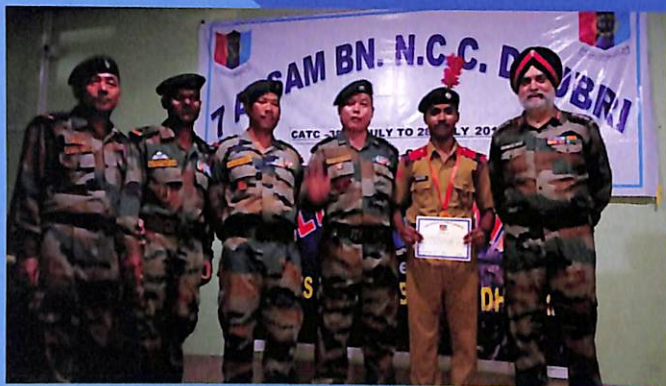
Achievement of NCC Cadet, Nabajyoti College On 28 th July, 2018