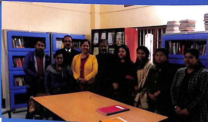
GU inspection team at Central Library On 10 th April, 2018