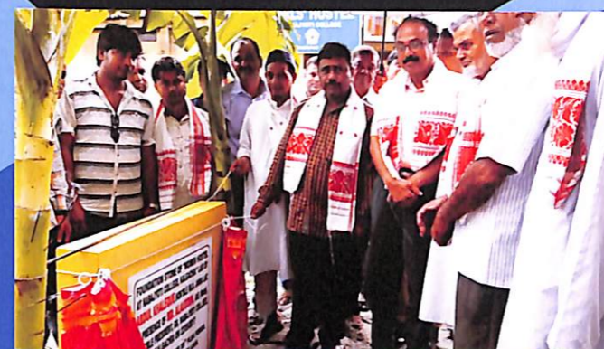
Hon'ble MLA, Jania LAC, laying foundation for Women's Hostel on 22 nd September, 2017