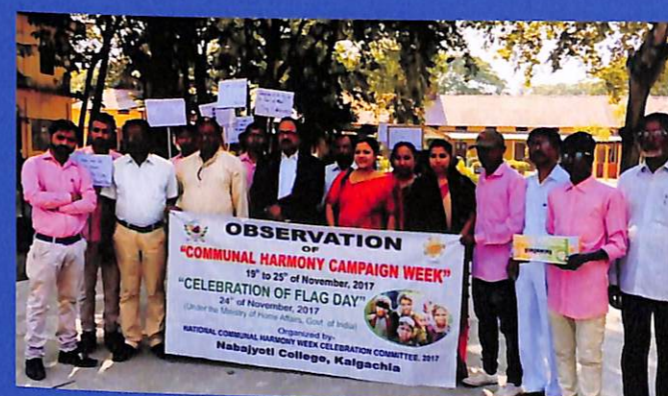
Fund Generation campaign of Communal Harmony Campaign Week from 19 th to 25 th November, 2017