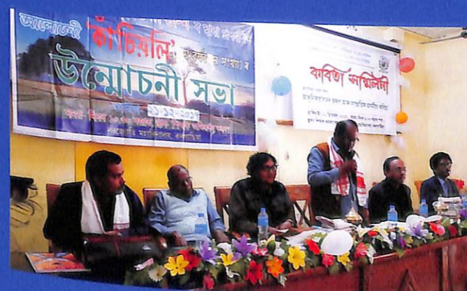
Kabita Sanmiloni organized by Asomiya Sahitya Chora, "Bodhidroom" on 21 st December, 2017