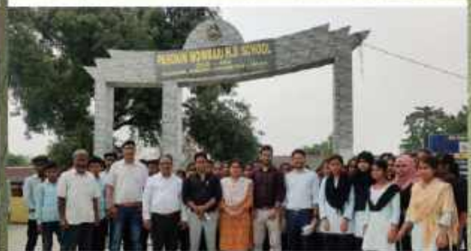
Visit to nearby school