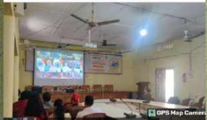
Programme on Vikshit Bharat