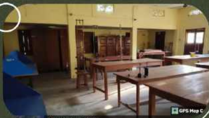
Department of Physics