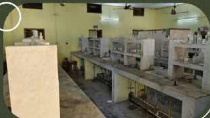
Department of Chemistry