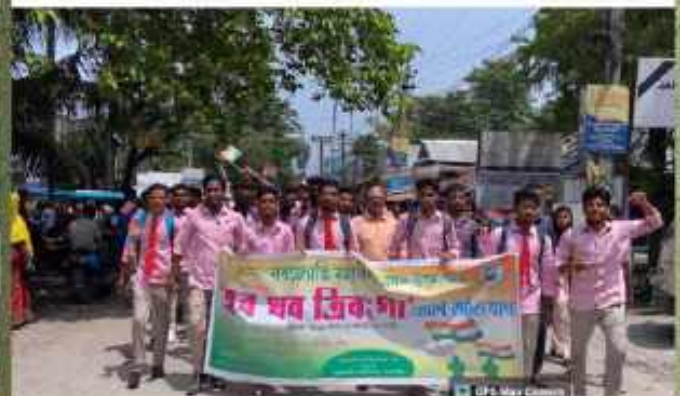
Har Ghar Tiranga Rally