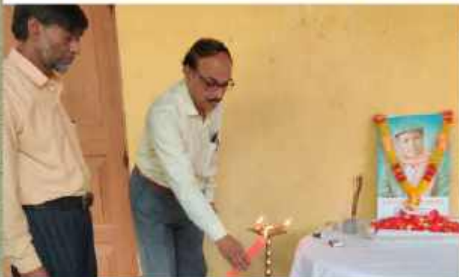
Observation of Student Day