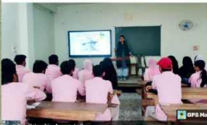
Documentary Screening on Shaheed Bhagat Singh