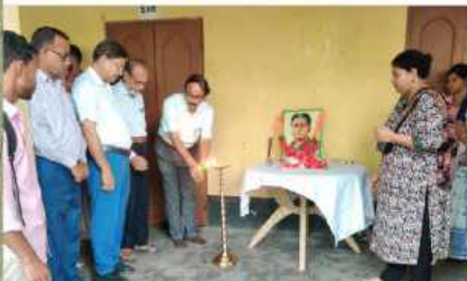
observation of birth anniversary of Lakshminath Bezbaruah