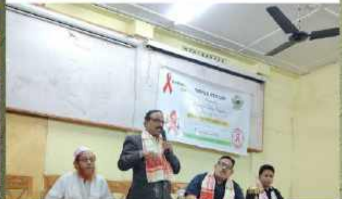
Observation of World Aids Day