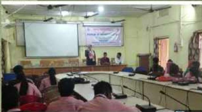
Hosting a Mock Parliament