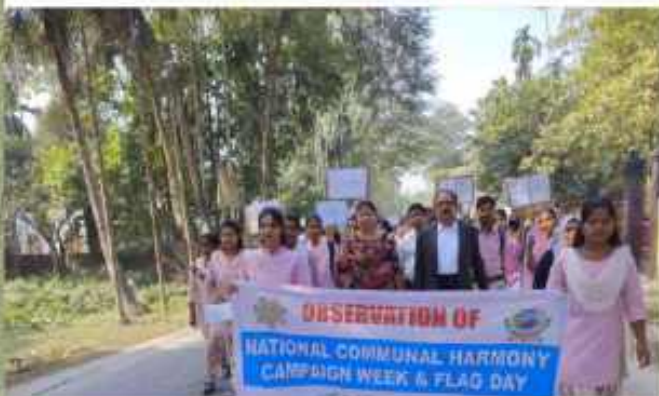
Observation of Communal Harmony Week