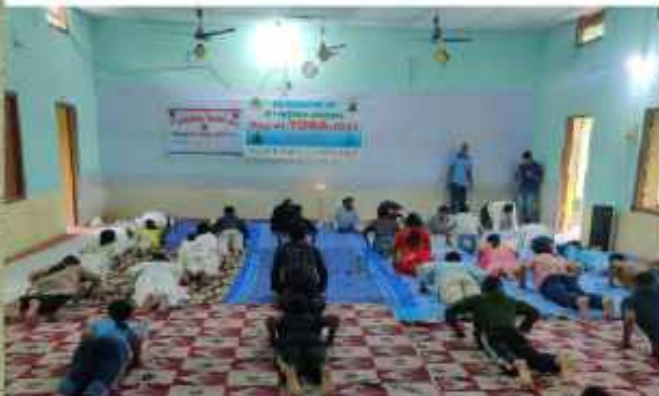
Observation of International Yoga Day