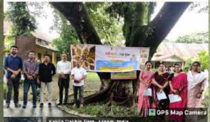
Meri Mati, Mera Desh