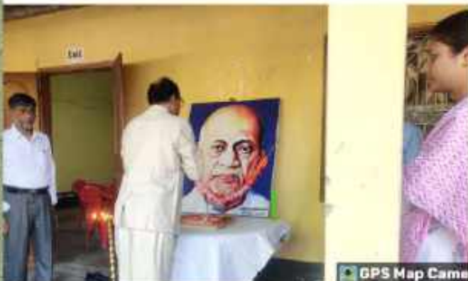
Observation of Unity Day