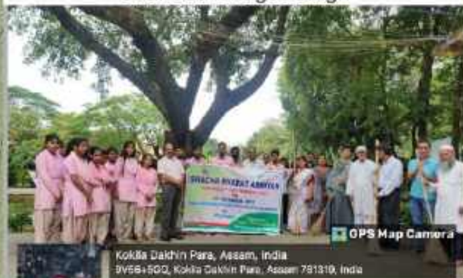
Gandhi Jayanti Cleanliness Drive