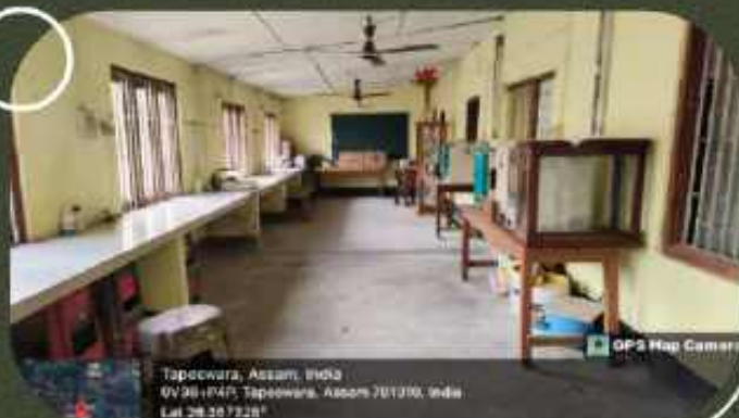
Department of Zoology