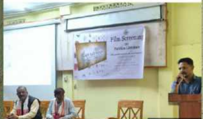
Film Screening on Partition Literature