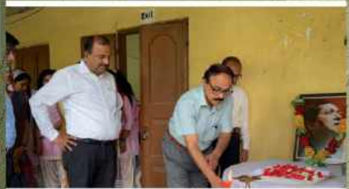
Observation of Rabha Divas