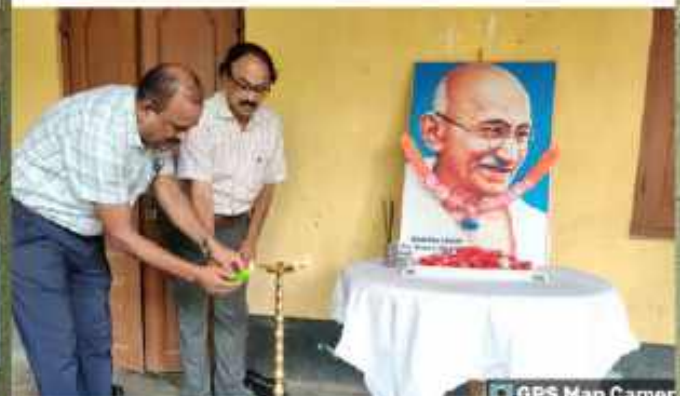
Observation of Gandhi Jayanti