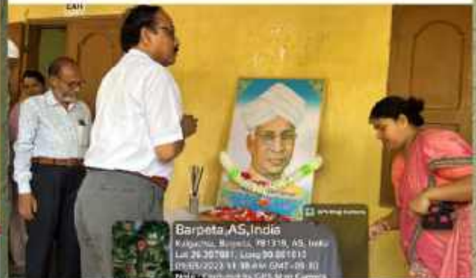
Observation of Teacher's Day