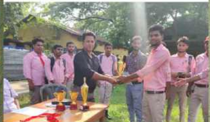
Observation of National Sports Day