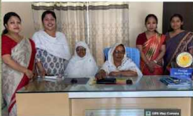
Visit to nearby schools