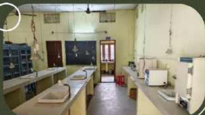
Department of Botany