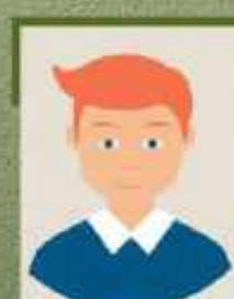
Part Time Teacher