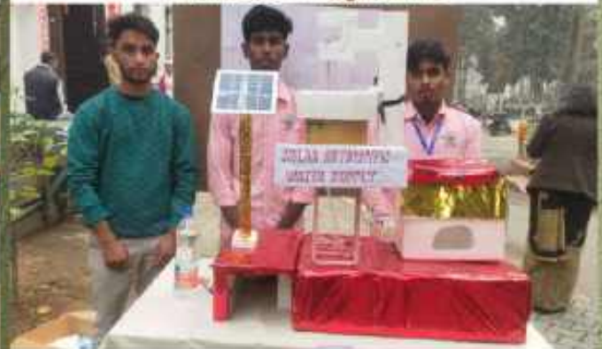
Scientific Model Presentation at GU