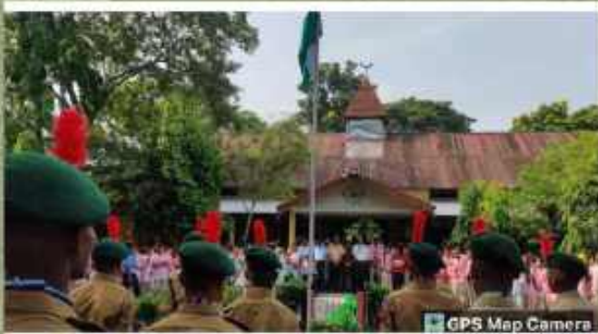
Observation of Independence Day