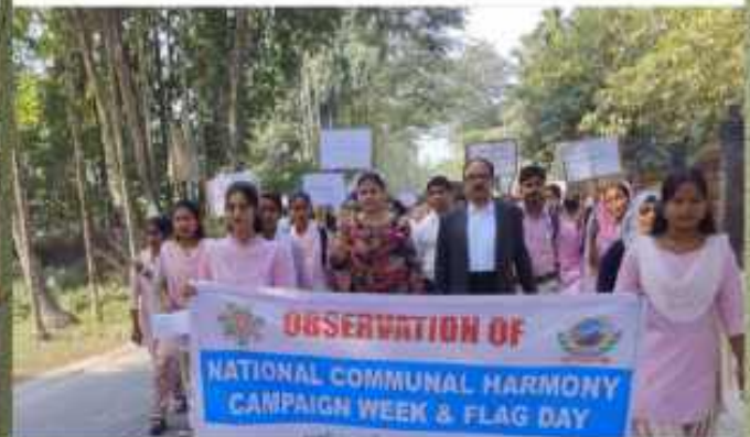
Communal Harmony Rally & Flag Day